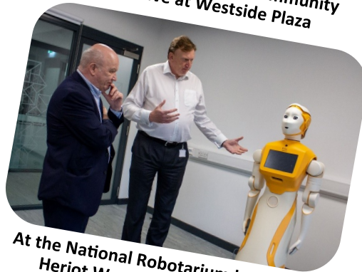
At the National Robotarium located on Heriot Watt University campus.