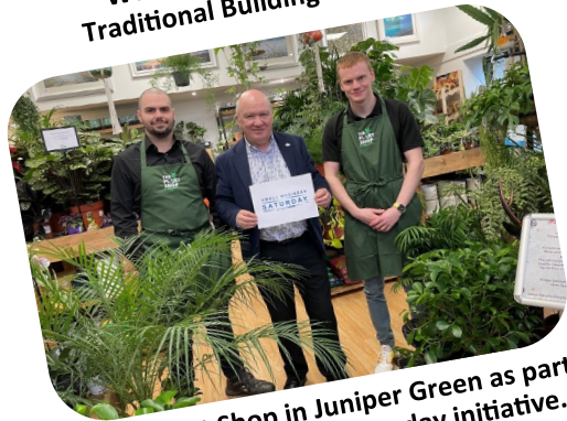
At The Plant Shop in Juniper Green as part of the Small Business Saturday initiative.