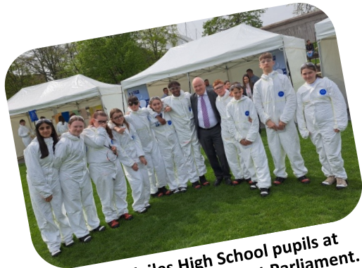
Wester Hailes High School pupils at Traditional Building Skills at Parliament.