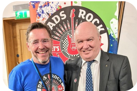
In Parliament celebrating the 10th anniversary of the founding of Dads Rock.