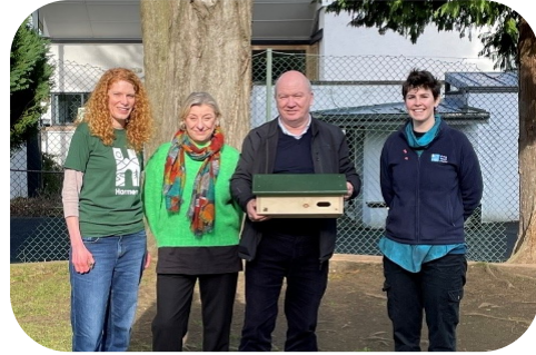
At Harmeny School in Balerno with RSPB to install new swift nesting boxes.