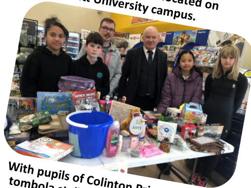
With pupils of Colinton Primary at their tombola stall in Colinton Mains Tesco.