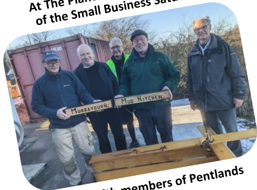
Meeting with members of Pentlands Men's Shed.