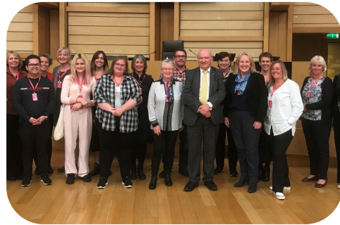
Celebrating 20 years of The BIG Project, a local organisation based in Broomhouse.