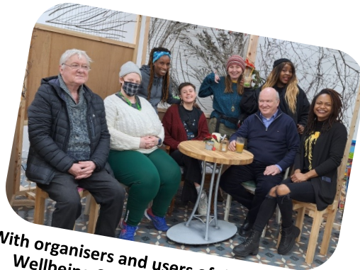
With organisers and users of the Community Wellbeing Collective at Westside Plaza